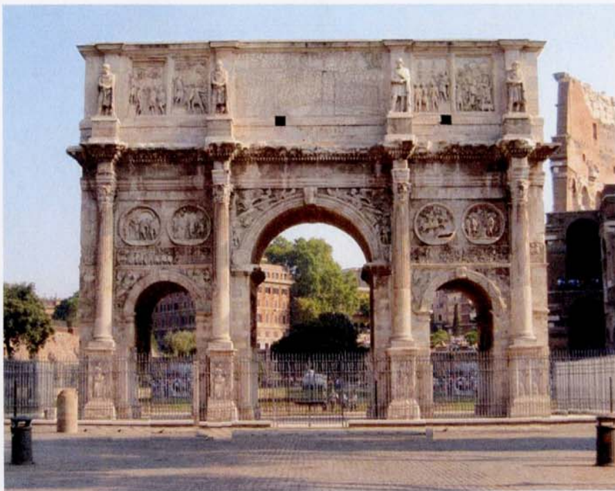
The arch of Constantine was constructed with brick and marble.